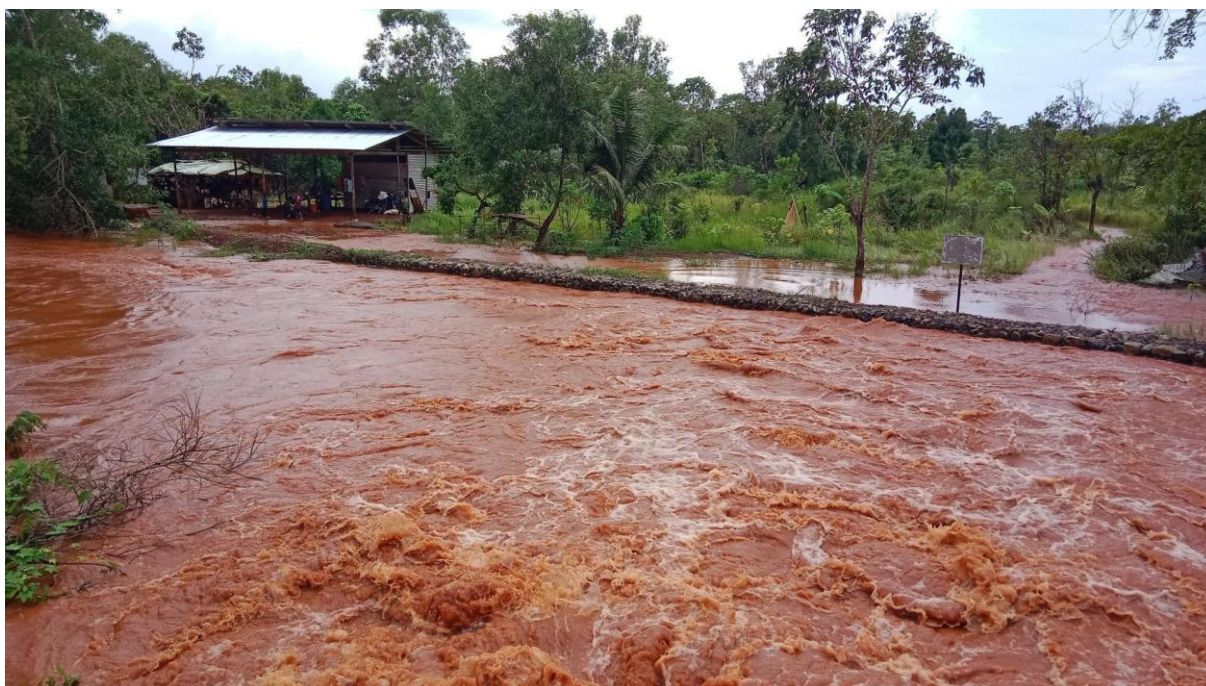
Photo: Togpon River in Bataraza, Palawan, where heavy rains continued day after day (September 2024)

According to the report (December 4, 2024) (attached to this request), which compiled the results of the 15-year investigation by the same expert, the levels of hexavalent chromium and total chromium in the Togpon River are lower during the dry season, while during the rainy season they significantly exceed the Japanese Environmental standard and the Japanese Water Supply Act standard (both 0.05 mg/L, and 0.02 mg/L after the revision) (see the figure above). In addition, during the most recent rainy season in September 2024, when heavy rainfall continued day after day, highest concentrations of hexavalent chromium (0.6 mg/L) and total chromium (0.471 mg/L) were observed in 15 years, equivalent with 24 to 30 times higher than the standards (see the photo below). The latest environmental standards in the Philippines stipulate the standard for hexavalent chromium as 0.01 mg/L for freshwater (the effluent standard is 0.02 mg/L) and as 0.05 mg/L for marine water (the effluent standard is 0.1 mg/L) 4 , while the drinking water standard stipulates 0.05 mg/L for total chromium 5 . And therefore, it also comes as no doubt that the above-mentioned values exceed the standards in the Philippines.