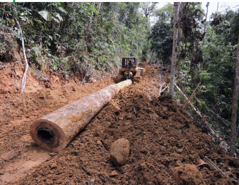
Highly illegal log production in Sarawak, Malaysia

We advocate for ways to reduce the use of timber with high illegality risk, propose sustainable uses for local timber, and conduct hands-on restoration activities in disaster areas.