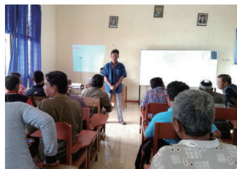
Skill share for community affected by sea-level rise