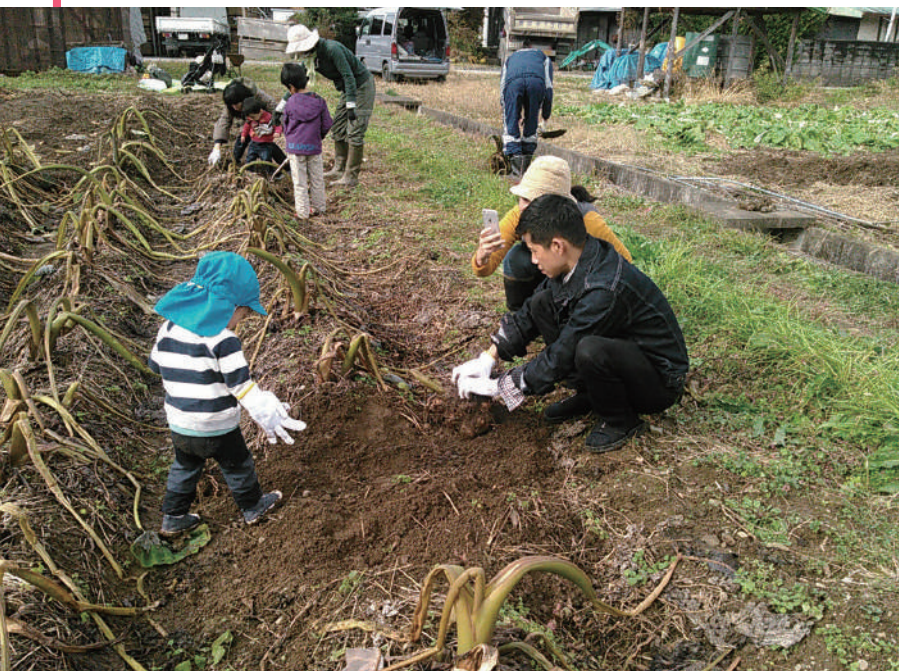
Everyone digging taro (Guruguru Smile Farm)