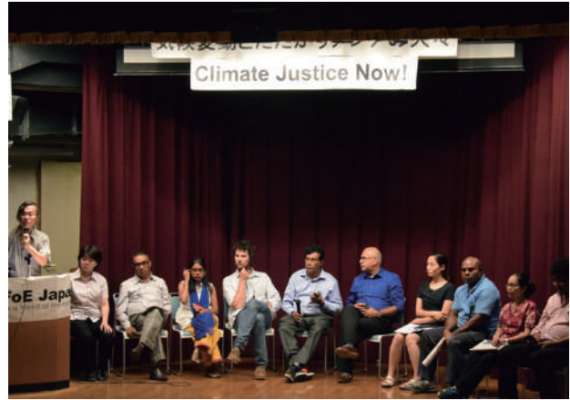
"Climate Justice Now: Climate Change and Voices from Asia" Symposium (Tokyo, August 1, 2016)

FoE Japan has for years cooperated in mangrove afforestation and other projects in Indonesia's Pekalongan City. This year, working with local environmental groups we investigated flood damage which is becoming increasingly serious in recent years, and summarized the situation in a short video. In Bandung village in that city, the combined effects of coastal erosion and storm surge are resulting in greater inundation of coastal areas, with serious impacts on daily life. Our February 2017 symposium on "Climate Change Reality and Climate