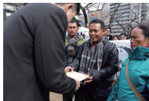
Residents opposed to Indramayu coal power project (Indonesia) visit Tokyo to ask Ministry of Foreign Affairs to stop JICA from financing the project (March 2017)