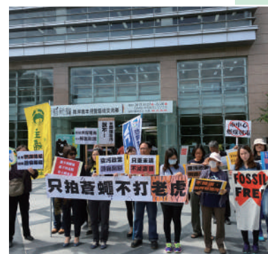
People demanding a nuclear phase-out in Taiwan

The Poka-Poka project aims to build resilience and strength in children, and to realize a future where children who have participated in the program can speak with their own voices to the national audience. Poka-Poka also tries to build a positive space with the help of the parents.