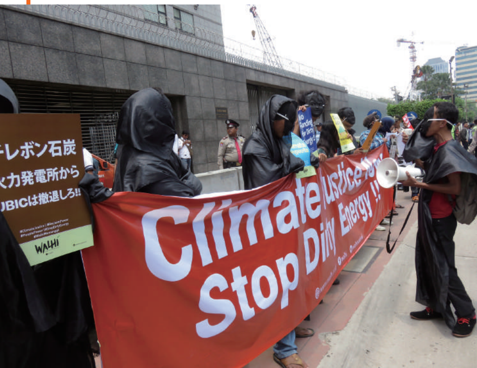
Residents protest to stop Japanese funding for Cirebon coal power project in front of Japanese Embassy in Indonesia (November 2016)

We monitor large-scale developments both domestically and abroad, and make policy proposals to respect human rights and protect the environment and the livelihoods of residents and communities.