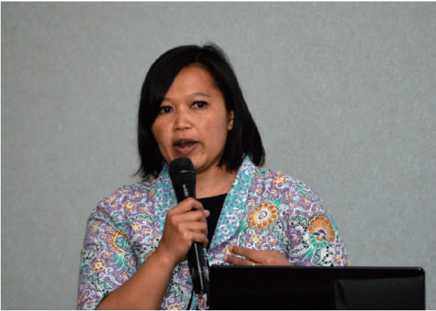
Indonesian environmental group member reports at Climate Justice Symposium (Tokyo, February 24, 2017)

house gases, while developing and poor countries suffer major damage. Presenters also shared examples of community-led efforts to deal with climate change. More than 160 people attended, and some commented that they now felt more familiar with the effects of climate change and the event made them think about Japan's responsibilities. By organizing the event in cooperation with other international cooperation and environmental groups, we were able to communicate and consider the issues together with more citizens.