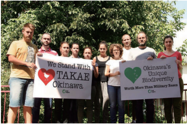
FoE Bosnia and Herzegovina members support biodiversity protection in Takae, Okinawa

In June 2016, JBIC also decided to finance the Batang coal-fired power plant in Central Java, where construction is in progress. The project is depriving residents of agricultural lands, so local farmers and fishermen who are opposed submitted a petition to JBIC in December and asked for a suspension of construction and restoration of their farmland and fishing grounds.