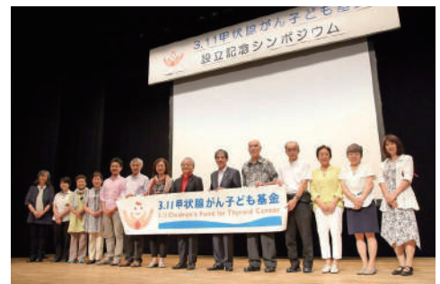
Symposium to launch 3.11 Children's Fund for Thyroid Cancer Patients