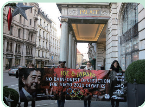
NGO representatives protest at IOC Board Meeting

In December 2016, 44 organizations including FoE Japan submitted a letter to IOC vice-president John Coats at the International Olympic Committee (IOC) Winter Board Meeting in Switzerland. It warned the IOC of the high probability that illegal and unsustainable tropical timber would be used in construction of facilities for the 2020 Tokyo Summer Olympics, and requested the IOC to instruct the JOC, Japan Sport Council (JSC), and the Organizing Committee to avoid timber from such sources.