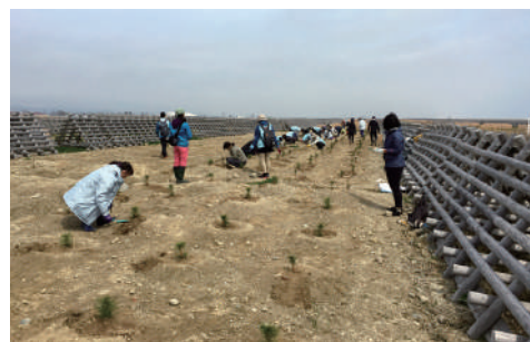
About 100 people participate in Coastal Forest Tree Planting Event 2016