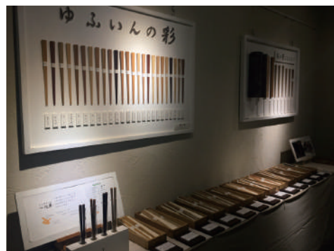
Fair Wood Cafe Exhibition (Yufuin: Hashiyaichizen)