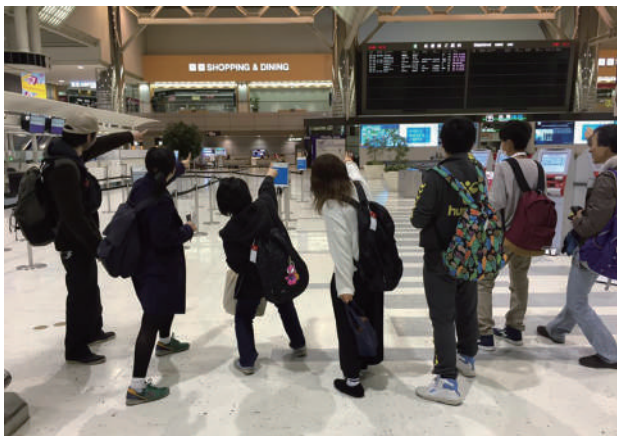
Fukushima high school students leaving for Germany! (April 2016)

“Cooperation Center for 3.11” ( http://hinan-kyodo.org/ ) in July 2016 to offer accident victims an information hotline and support to meet their specific needs. We also collaborate with local politicians to call for stronger local support policies for evacuees. The Center still receives urgent calls from evacuees in difficult situations.