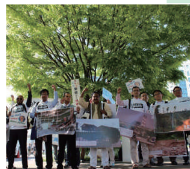
At the Asian Development Bank annual meeting, NGOs protest human rights violations and environmental destruction caused by development funding (Yokohama, May 2017)

We will collaborate with FoE member organizations in the Asia-Pacific region and seek to stop false climate solutions in Japan and Asia such as new coal power and nuclear exports. In Japan, we will cooperate with local groups to stop the construction of coal power plants in Tokyo Bay. We will also continue to use our Climate Justice literature and continue dialogue with international cooperation and environmental groups.