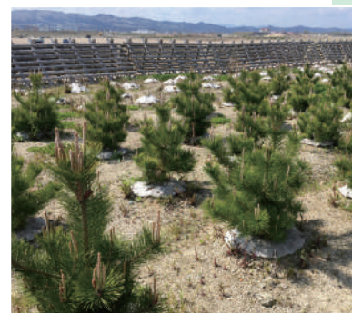
Healthy two-year black pines

While continuing to donate wood products in areas where demand for tree education workshops is expanding, we will also expand the “Gift from the Forest” program into new areas.