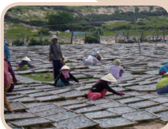
Fishing village close to the planned site for nuclear power plant

In November, the Vietnamese National Assembly decided to abandon plans to build its first nuclear power plant, a project which involved Japan exporting nuclear plants to Vietnam. FoE Japan acted early to oppose the export of nuclear plants, by conducting site surveys and widely announcing the findings. In October, FoE Japan reported on the serious damage from the Fukushima nuclear plant accident to representatives of the Vietnamese National Assembly.