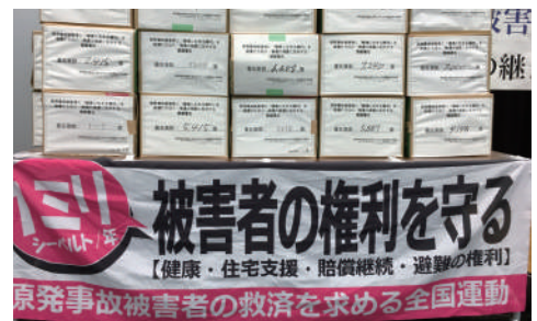
Submission of about 190,000 signatures urging government not to withdraw housing for 3.11 evacuees