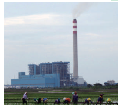
Fertile agricultural land in Indramayu, threatened by a new coal power plant

In Indonesia, we will continue to support alternatives to large, environmentally-destructive development projects that do not meet local community needs. In communities that are seriously affected by climate change, we will continue to support locally-led development and climate adaptation programs.