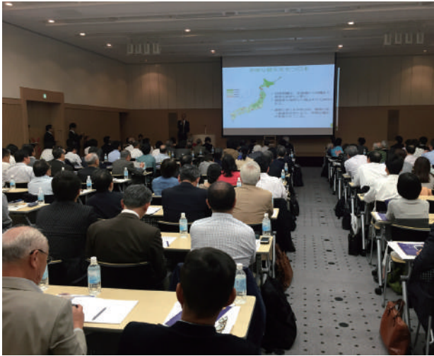
Wise Forum 2016 on theme of environment and Fair Wood. We also hold monthly Fair Wood research group meetings.

of timber that will be used in construction for the Tokyo 2020 Games-related facilities. As a result, the Organizing Committee issued timber procurement criteria in June 2016, which include a level of timber legality conforming with EU timber-related regulations. Actual outcomes will depend on implementation, but we hope to see good timber procurement in practice. Regarding the new National Stadium to be constructed, with cooperation from overseas NGOs we arranged for our written request to be hand delivered to the Vice President of the International Olympic Committee (IOC), asking that at the very least, the IOC advise the Japan Sport Council (which is in charge of construction) to follow the IOC's timber procurement criteria.