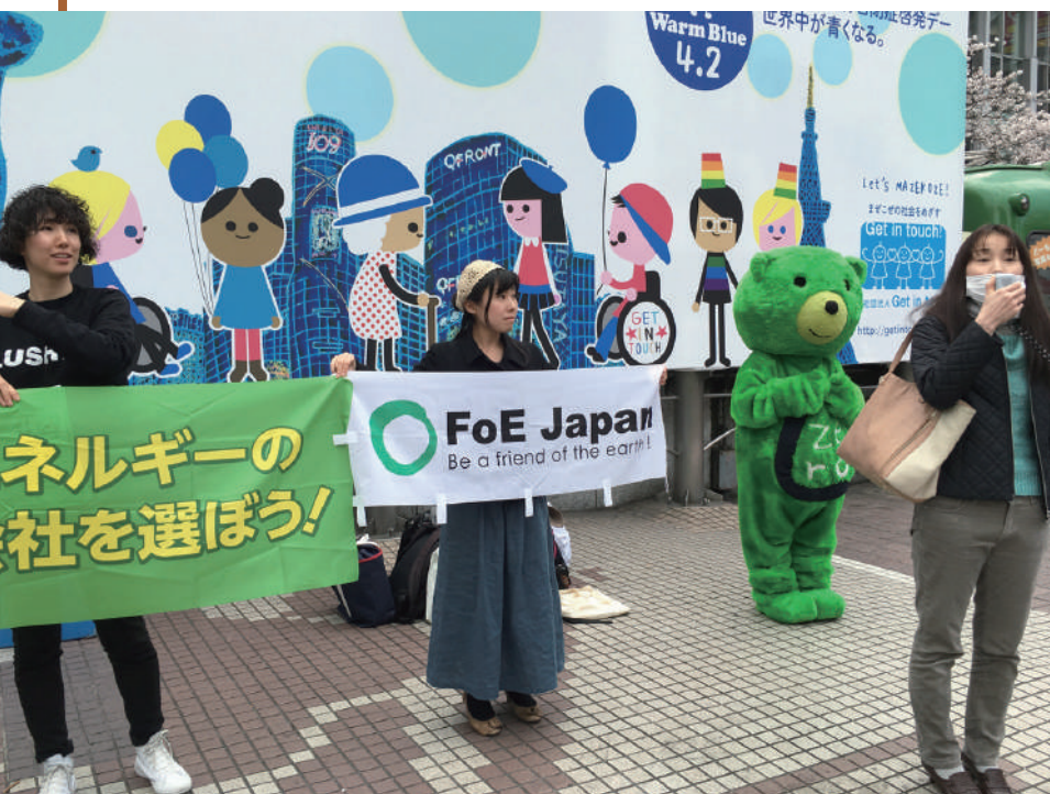
On the first day of electricity market liberalization, appealed for a "Power Shift" (Shibuya, Tokyo)

Since the Tohoku earthquake/tsunami disaster and nuclear accident on March 11, 2011, we have been supporting victims of the nuclear disaster and advocating for a nuclear phase-out and sustainable energy policies.